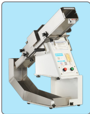
Bagel Slicer Model 723 with Return Chute