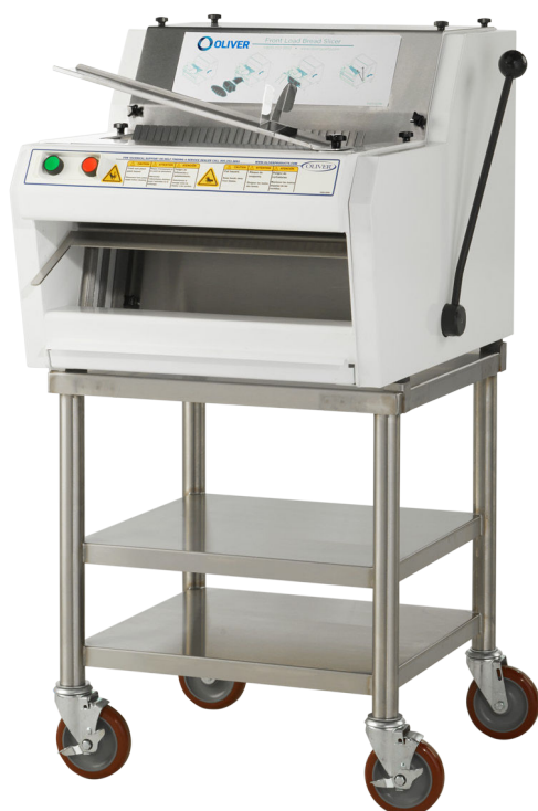
Slicer shown with optional stainless-steel cart