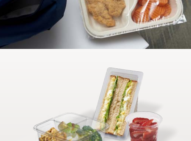
Grab & Go, After School, & Snacks