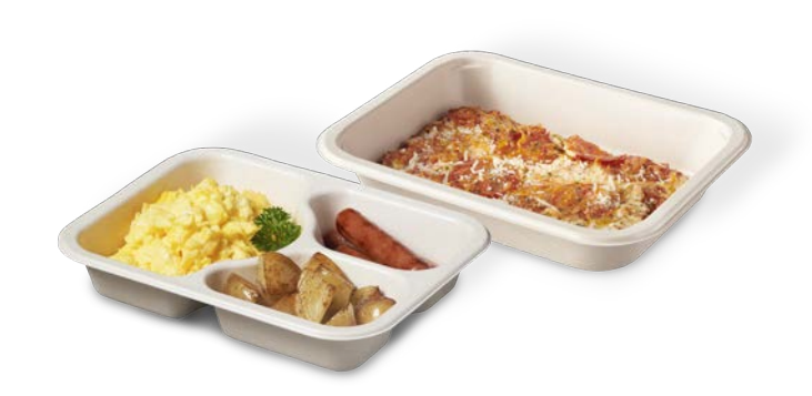
Breakfast, Lunch, & Supper